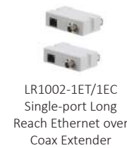
LR1002-1ET/1EC Single-port Long Reach Ethernet over Coax Extender