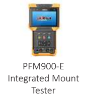
PFM900-E Integrated Mount Tester