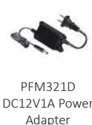
PFM321D DC12V1A Power Adapter